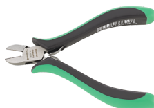
67076000 Electronic side cutter