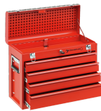
81091004 Tool box