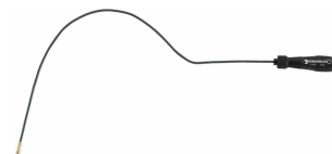
77260027 Magnetic lifter