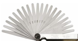
74240002 Precision feeler gauge