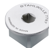
58521087 Square drive adaptor