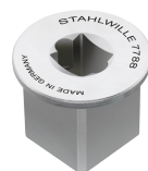
58521088 Square drive adaptor