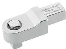
58243004 Calibrating square drive insert tool