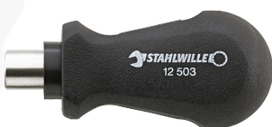
18110016 Bit holder