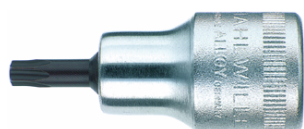
03100027 Screwdriver socket