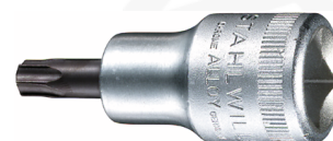
03100020 Screwdriver socket