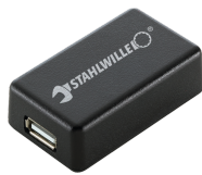
52110061 Interface adaptor