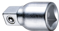
13010001 Socket extension