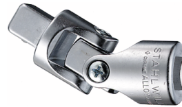
13020000 Universal joint