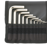
96435504 Hex key set