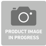
83092011 Hard foam insert for tool case