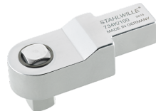
58243040 Calibrating square drive insert tools