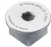
58521087 Square drive adapter