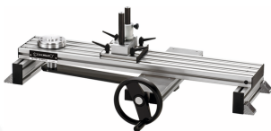
52110091 Mechanical calibration device