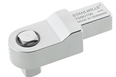
58243020 Calibrating square drive insert tools