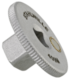
11030010 Square drive adapter