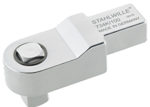
58243005 Calibrating square drive insert tools