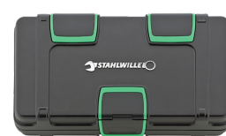
81251019 Tool case