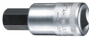
03050014 INHEX screwdriver socket