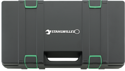
81271019 Tool case