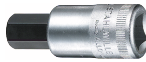
03050012 INHEX screwdriver socket