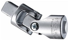
13020000 Universal joint