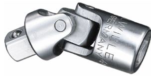
11020000 Universal joint