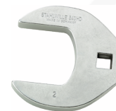
02501042 CROW-FOOT spanner heavy-duty, inch