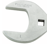
02501060 CROW-FOOT spanner heavy-duty, inch