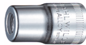
12180030 Bit holder