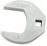
02501056 CROW-FOOT spanner heavy-duty, inch