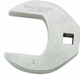
02501058 CROW-FOOT spanner heavy-duty, inch