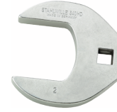
02501062 CROW-FOOT spanner heavy-duty, inch