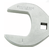
02501042 CROW-FOOT spanner heavy-duty, inch