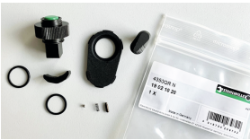
19021020 Spare parts set for ratchet No.435QR N