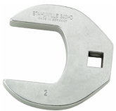
03501072 CROW-FOOT spanner heavy-duty, inch