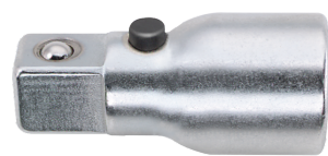
13011001 QuickRelease extension