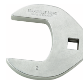
02501054 CROW-FOOT spanner heavy-duty, inch