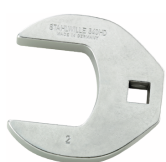
02501024 CROW-FOOT spanner heavy-duty, inch