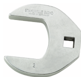
02501052 CROW-FOOT spanner heavy-duty, inch