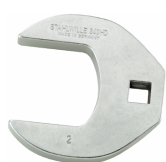
02501028 CROW-FOOT spanner heavy-duty, inch