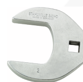
02501034 CROW-FOOT spanner heavy-duty, inch