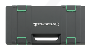
81251014 Tool case