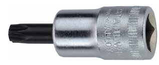
02100027 Screwdriver socket