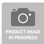
83092013 Hard foam insert for tool case