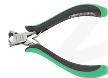
67096000 Electronic end cutter