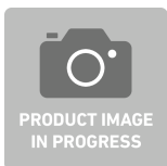
61014479 1/3 TCS insert