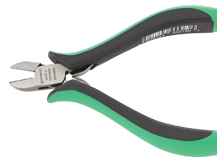
67076000 Electronic side cutter