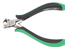
67106000 Electronic diagonal cutter