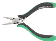
67116000 Electronic needle nose pliers