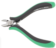
67086000 Mini-electronics side cutter