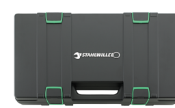
81271019 Tool case