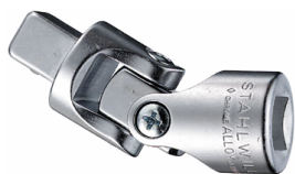
13020000 Universal joint