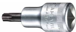
03100045 Screwdriver socket