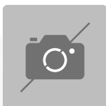
19050000 Spare part set for ratchet