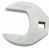
03501064 CROW-FOOT spanner heavy-duty, inch