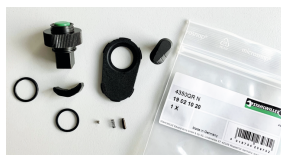
19021020 Spare parts set for ratchet No.435QR N