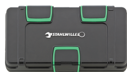
81251019 Socket set