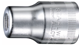
13180010 Bit holder