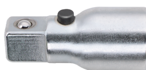
13011001 QuickRelease extension