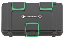
81251019 Tool case